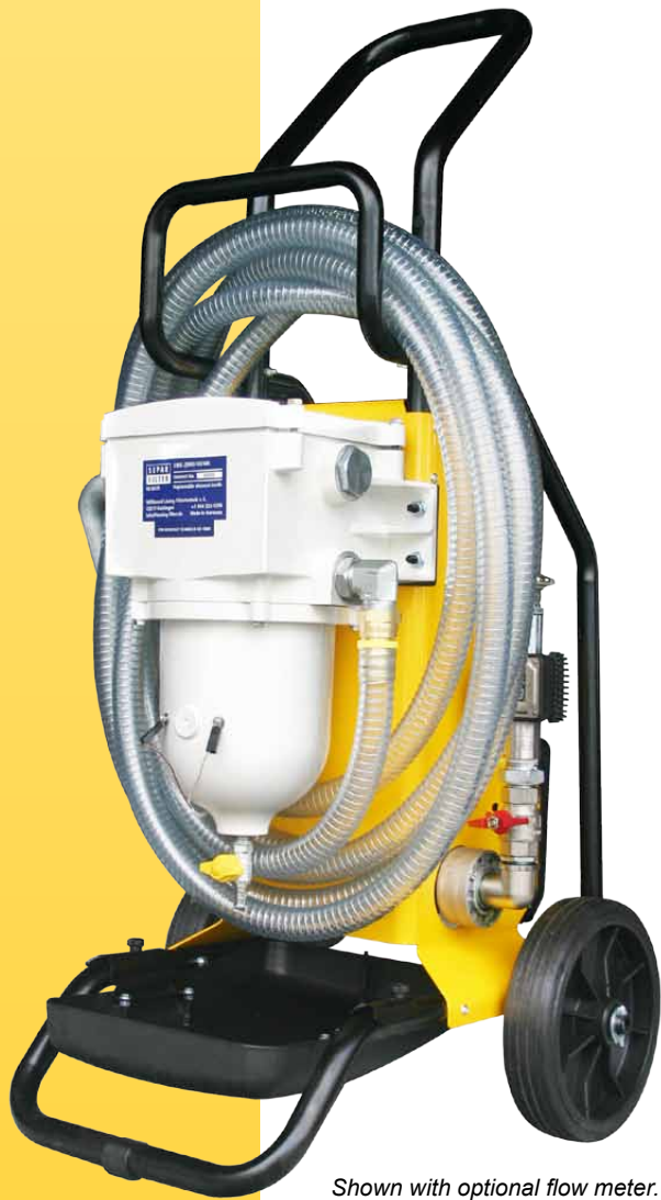
Shown with optional flow meter.