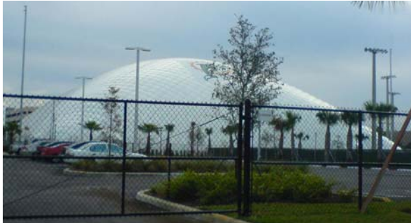
Miami Dolphins Training Camp, Davie, FL