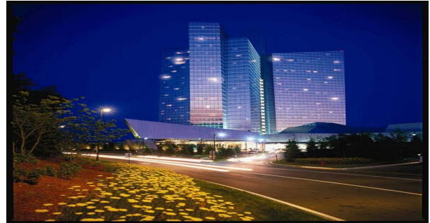
Mohegan Sun Casino, Uncasville, CT

"No matter how well maintained and tested your stand-by generators are, if you don't maintain the diesel fuel in your storage tanks, your generators WILL FAIL."